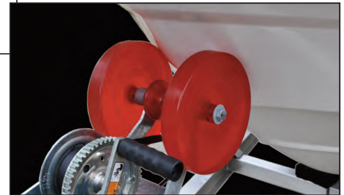
Recommended Bow Stop and Side Rollers

Keep Side Guides LOW - just above fenders