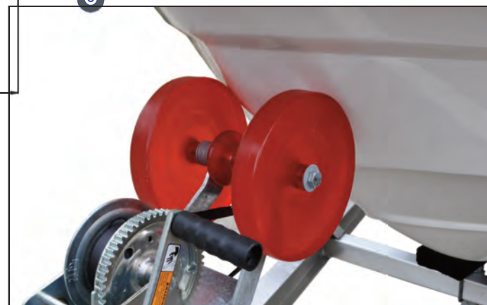
Recommended Bow Stop and Side Rollers

Locating 4 foot long carpeted side guides over the wheel fenders is recommended for easy loading.